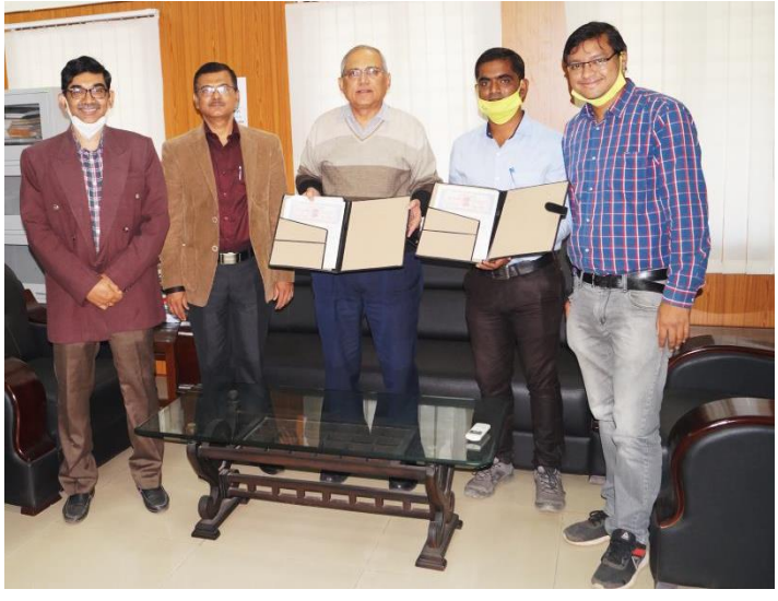
MoU with Syngenta India Pvt. Ltd., Pune

A Contract Research Project entitled "Evaluation of scholar 230SC (Fludioxonil w/v 23% SC) for postharvest disease management in Nagpur mandarin" signed with M/s Syngenta India Pvt. Ltd. Pune on 16<sup>th</sup> January, 2021 for a period of 2 years.