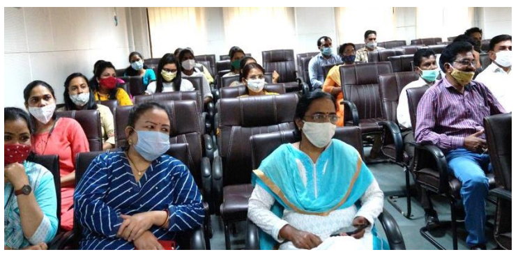
A view of the participants