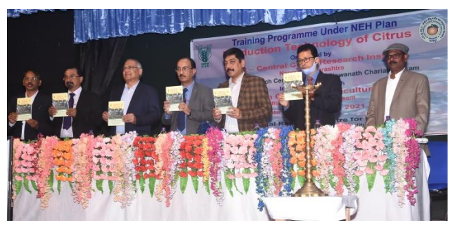
Dignitaries releasing the Publications

✓ Publications (1) Management of Khasi Mandarin in Assam and other North-Eastern States (2) High density cultivation of Nagpur mandarin (3) Management Practices of Assam Lemon were released.