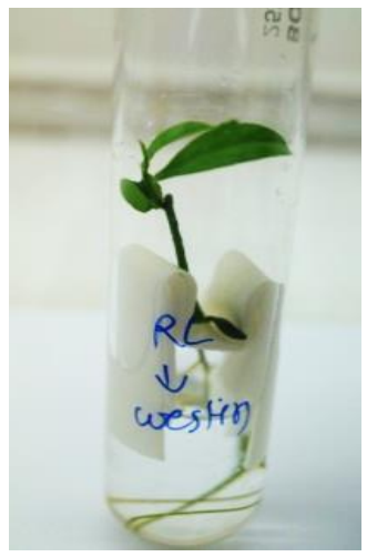
STG of Westin Sweet orange