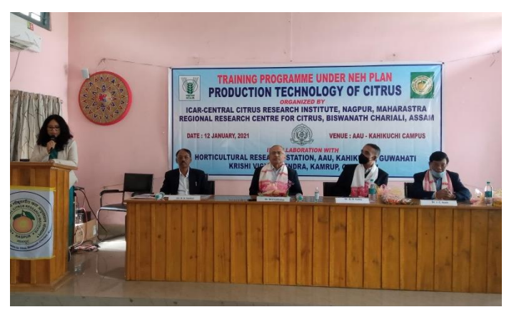
Dignitaries during the training programme