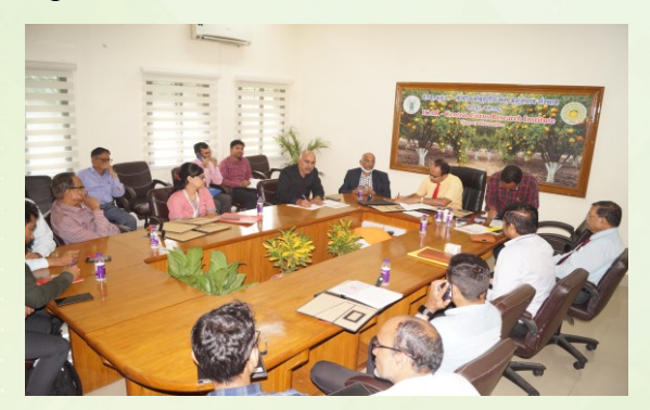
MoU signing with 7 Hospitals

Signed MoU with seven CGHS approved hospitals of Nagpur (Avanti Hospital, Ganga Care Hospital, KIMS Kingsway Hospital, Meditrina Institute of Medical Sciences, RNH Hospital, Viveka Super Speciality Hospital and Wockhardt Super Speciality Hospital) for providing the cashless medical facility to employees (both serving and retired) of Nagpur based ICAR institutes / regional station on 27<sup>th</sup> September, 2022.