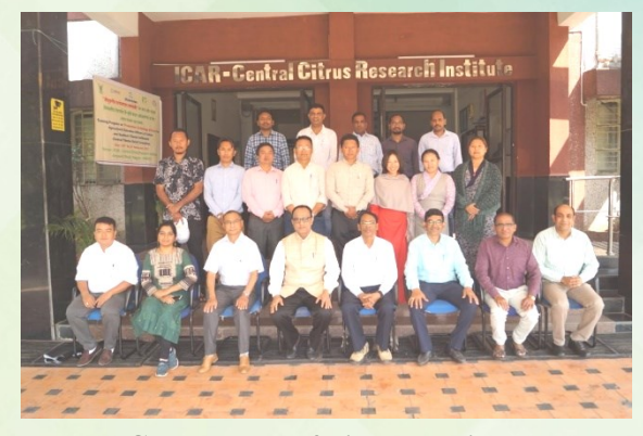
Group photo of Tibetan trainees

establishment, bahar management, fruit drop, nutrient and water management in citrus, disease and insect pest management of citrus, citrus cultivars, raised bed plantation system and rootstock selection, nematode management and rejuvenation technology of declined citrus orchards and demonstration of the packing line facility for citrus. The theories were combined with detailed practical sessions. Off-campus exposure visit to scientifically managed citrus orchard of progressive farmers Shri Prashant Shelke and Shri Akhil Junghare of Nagpur district were conducted. Trainees were also provided with magnifying glass, informative pamphlets of citrus disease-pest management and two books from CCRI publication to help trainees learn more about citrus production technologies.