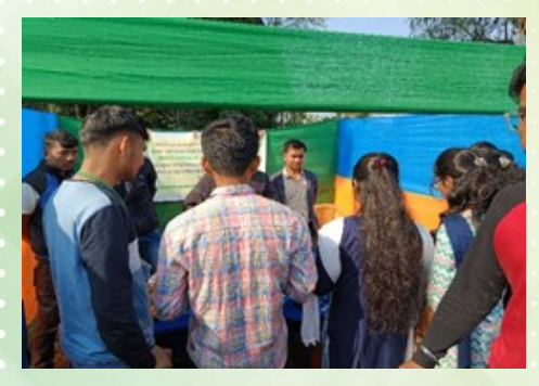
Students of Biswanath College of Agriculture visiting exhibition stall of RRCC

Displaying different varieties and species of citrus during Luminox 2.0 Agricultural Exhibition, Biswanath College of Agriculture, Biswanath Chariali on 22<sup>nd</sup> December, 2022.