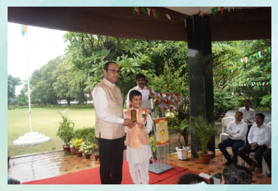
Prize distribution to children awardees

On 15<sup>th</sup> August, 2022 after the flag hoisting ceremony, a vehicle rally by the entire staff of CCRI displaying the strength of farm machinery of the institute and unity in diversity of the nation was organized for about a distance of 2 km. The vehicle rally was accompanied by Tiranga march by the staff and security personnel amidst the backdrop of patriotic songs. Children of staff were also awarded prizes on the occasion according to their academic performance in respective schools.