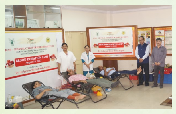
Blood donation camp at CCRI premises

Director and staff distributed fruits, clothes, rakhis and lunch boxes to about 300 children, men and women residents of Mahakali Nagar slum area of Beltarodi, Nagpur on 11<sup>th</sup> August, 2022 with voluntary contributions made by CCRI staff for this program. The slum was affected by a fire incident of 66-cylinder blast recently.