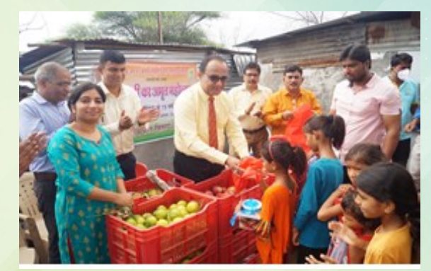
Fruits and Cloth distribution at Beltarodi

On 12<sup>th</sup> August, 2022, a tree plantation drive was conducted at Panchwati Vridhashram (Old Age Home) and Shradhanand Anathalay (Orphanage) where Nagpur mandarin and Acid Lime plants were planted by CCRI staff. A similar planatation drive was also conducted on 13<sup>th</sup> August, 2022 at nearby Wadi Police Station premises.