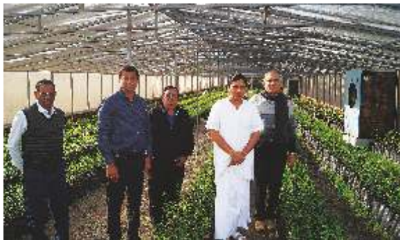
Shri Acharya Balkrishna, General Secretary, Patanjali Research Foundation visited the CCRI & TMC nursery

citrus varieties being grown at the Institute for processing purpose and also the research farm and hi-tech nursery. The Patanjali plans to setup a citrus germplasm unit at Rishikesh.