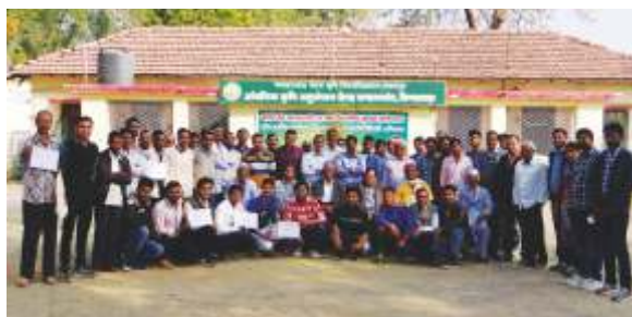
Group photo at the four-days training programme of TMC Chhindwara