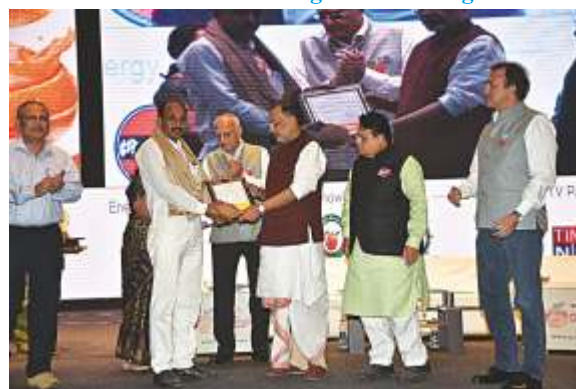
Felicitation of farmer with Dr. Shyam Singh Best citrus grower award by the Hon'ble Union Agriculture Minister