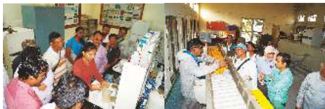
Participants having hands on practice on the various activities Chhindwara (Madhya Pradesh)