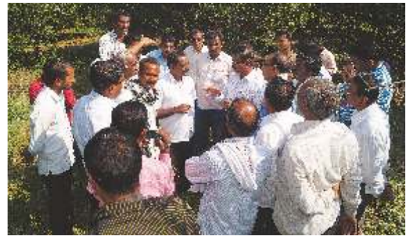
CCRI scientists visited citrus orchard at Pathrot (Achalpur Tahsil, Dist. Amravati)