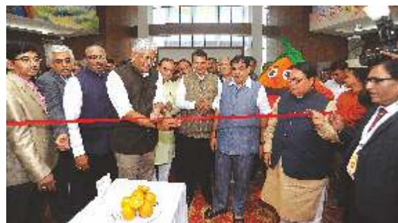
Minister of State for Agriculture & Farmers Welfare, Shri Gajendra Singh Shekhawat inaugurating the "Citrus Fruit Show" during World Orange Festival

ICAR-CCRI, organized three seminars during the three-day event in which Institute scientists, experts from Israel, Bhutan and SAUs and ICAR Institutes presented overviews of citrus industry.