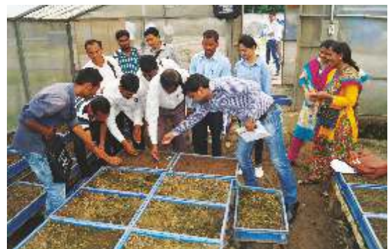
Participants having hands on practice for seed sowing in primary nursery