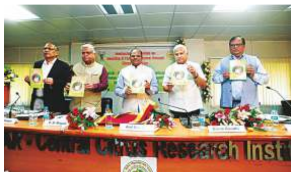
Dignitaries releasing the Publication

included all stakeholders including progressive growers, their societies, agriculture department representatives etc. A publication entitled “Citrus Cultivation Technologies for Doubling of Farmers' Income” was also released.